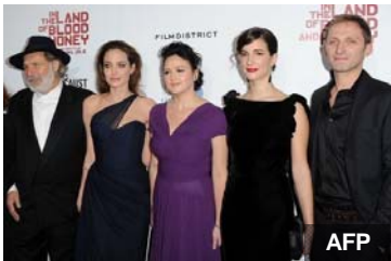
Jolie and film cast

LOS ANGELES - Oscar-winning actress Angelina Jolie has won praise for her directing debut - a powerful story of love amid the atrocities of the Bosnian war - from both film critics and victims' relatives.