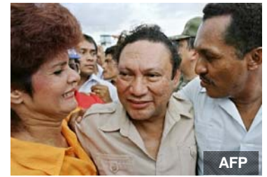
Noriega in 1987

"I want to go back to Panama to prove my innocence in these